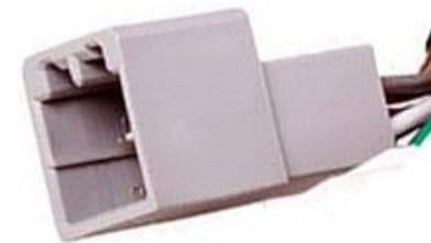
Fig. 3 10-pin connector