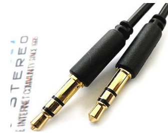
Fig. 6 audio cable