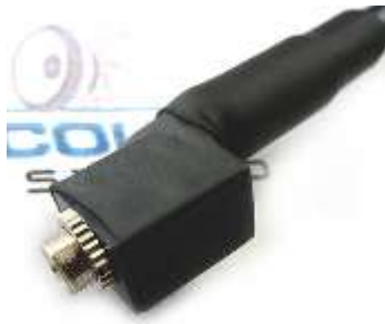
Fig. 4 Audio Jack