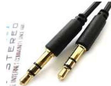
Fig. 6 3.5mm Male audio cable