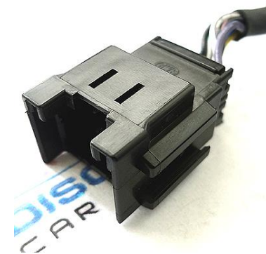
Fig. 3 12-way connector