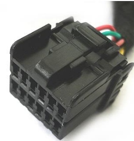
Fig. 1 Ford 12-way plug