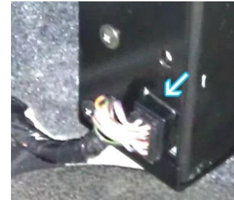
Fig. 2 Ford CD Changer