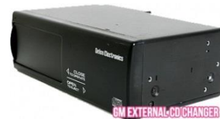
Example of required remote CD changer

** Any reference to remote CD changer is to those installed in lower dash, center armrest, hatch, trunk etc. GM AM/FM radios with built-in 6-CD is internal not external .