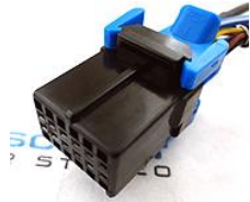
Fig. 3 12-pin plug