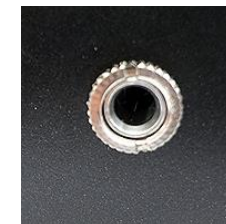
Fig. 4 input jack