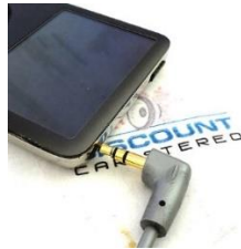
Fig. 6 3.5mm plug