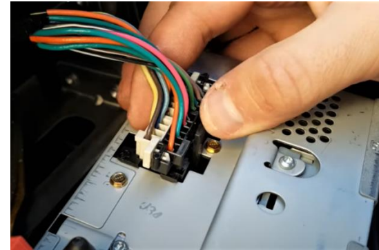
Fig. 1 20-pin radio plug