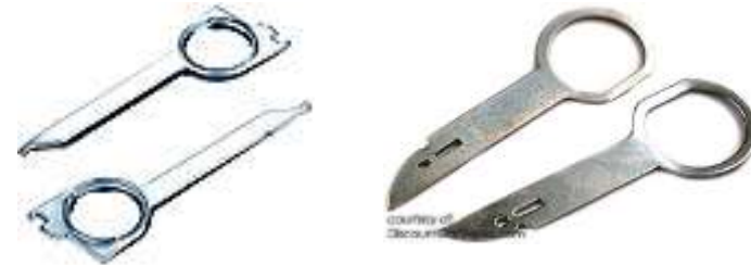
Fig. 1 Radio removal Tools