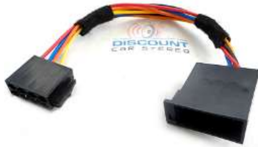
Fig. 7 Power harness