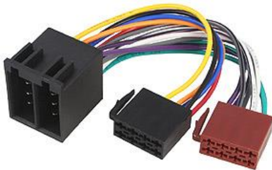
Fig. 4 harness

NEW: This revised edition (4.4.22) allows the Continental radio to power speakers from its internal amplifier, or bypass radios built-in amplifier in favor of aftermarket amplification or both. To bypass radio's internal amplifier, do not connect factory "B" plug to this harness.