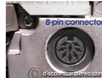
Fig. 2 Radio connector