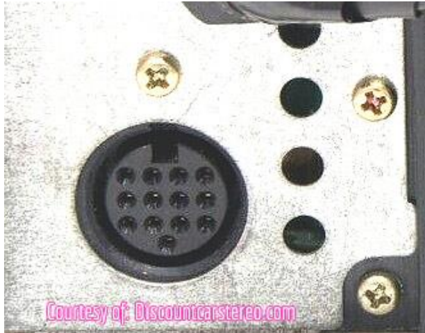
Fig. 3 radio socket