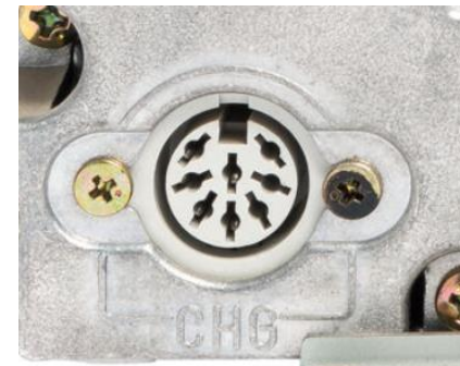
Fig. 2 8 pin socket