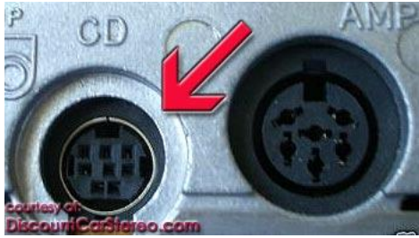
Fig. 4 8-pin "CD" port