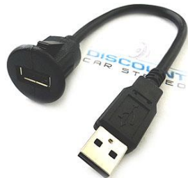
Fig. 11 USB cable