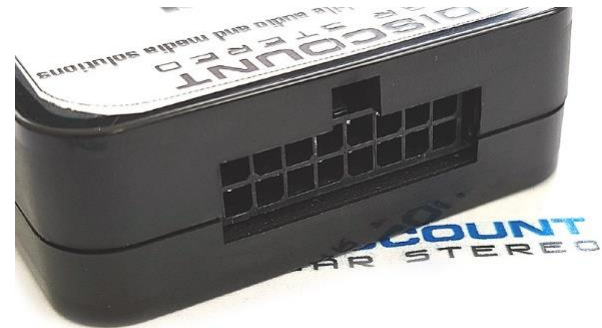
Fig. 6 16-pin socket