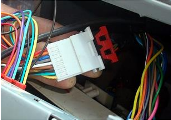
Fig. 3 9-pin socket