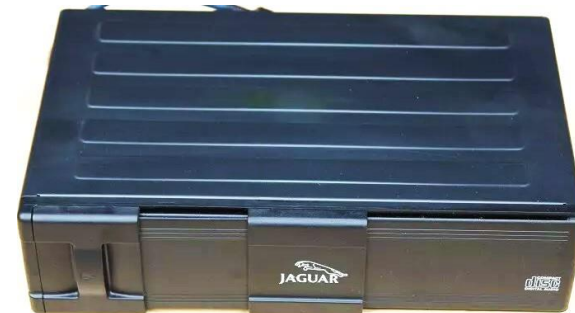
Fig. 11 required CD changer

The BTA-JAG97CD works only in vehicles with a functioning 6-disc CD changer in trunk/hatch. CD changer remains connected and functional to provide Streaming and USB charging (See Fig. 11 )