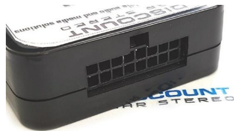
Fig. 6 16-pin socket