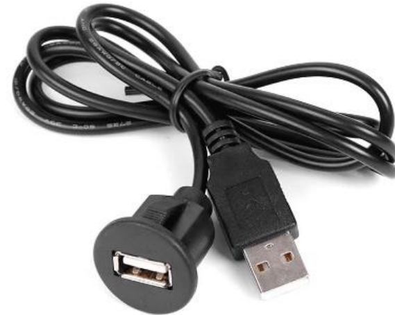
Fig. 8 optional dash mount extension cable